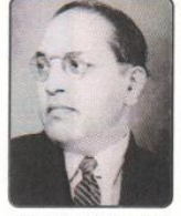
Dr. B.R. Ambedkar

Office: B-3/4, Sagar Apartments, Shahnoorwadi, Opp. Shahnoormiyam Durgah, Aurangabad- 431005 (MS) Ind., Ph.: 0240- 2320820