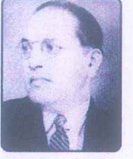
Dr. B.R. Ambedkar

Office: B-3/4, Sagar Apartments, Shahnoorwadi, Opp. Shahnoormiyan Durgah, Aurangabad- 431005 (MS) Ind., Ph.: 0240- 2320820