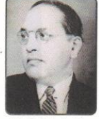
Dr. B.R. Ambedkar

Office: B-3/4, Sagar Apartments, Shahnoorwadi, Opp. Shahnoormiyan Durgah, Aurangabad- 431005 (MS) Ind., Ph.: 0240- 2320820