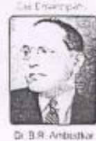
Dr. B.R. Ambedkar

Office: B-3/4, Sagar Apartments, Shahnoorwadi, Opp. Shahnoormiyan Durgah, Aurangabad- 431005 (MS) Ind., Ph. 0240- 2320820